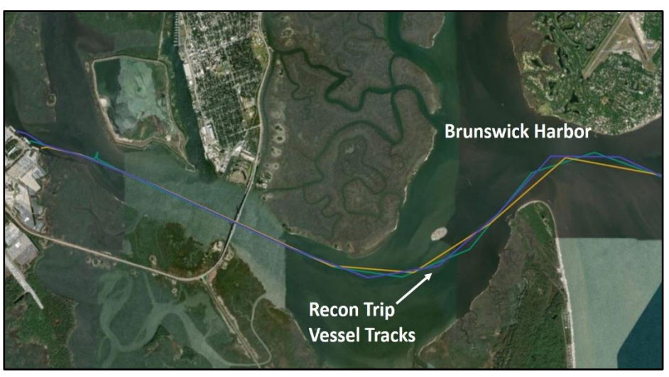
Figure 1. Vessel tracks for the Brunswick Harbor reconnaissance trip

The purpose of this reconnaissance trip was to visit Brunswick Harbor, GA to provide an introductory understanding of the project area for an upcoming ship simulation study and to take digital imagery of the harbor. This trip allowed for a kick-off meeting with local harbor pilots, ERDC personnel, and the U.S. Army Corps of Engineers Savannah District (CESAS) personnel. During the kickoff meeting, current port operations and the proposed harbor improvements to be studied during a ship simulation study were discussed. During this trip, digital imagery was taken aboard several vessels around the area of interest. Several vessel transits occurred riding Ro/Ro vessels outbound from Colonel's Island Terminal in Brunswick Harbor (vessel tracks are shown in purple and yellow in Figure 1) and riding a Ro/Ro inbound (vessel tracks are shown in green in Figure 1).