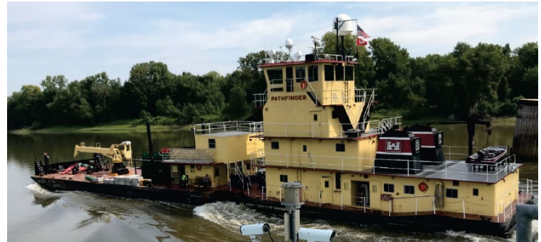
Figure 1. The US Army Corps of Engineers (USACE) vessel Pathfinder.